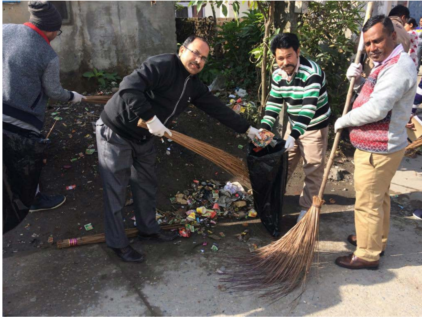
Dehradun, Uttarkhand Windlass Biotech and CII Uttarakhand held a cleaning drive in the Mohabewala Industri- al Area.