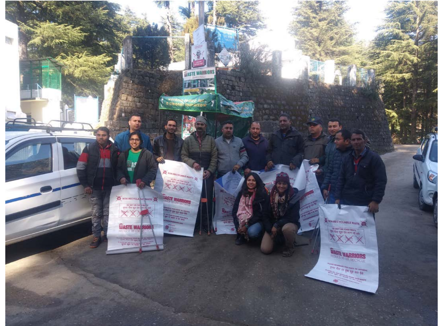
Dharamsala, Himachal Pradesh Waste Warriors brought together the Dharam- kot community for a cleaning drive in the locality. The temperature was low but the spirits were high; the charming vil- lage was cleaned of 120 kgs of dry waste.