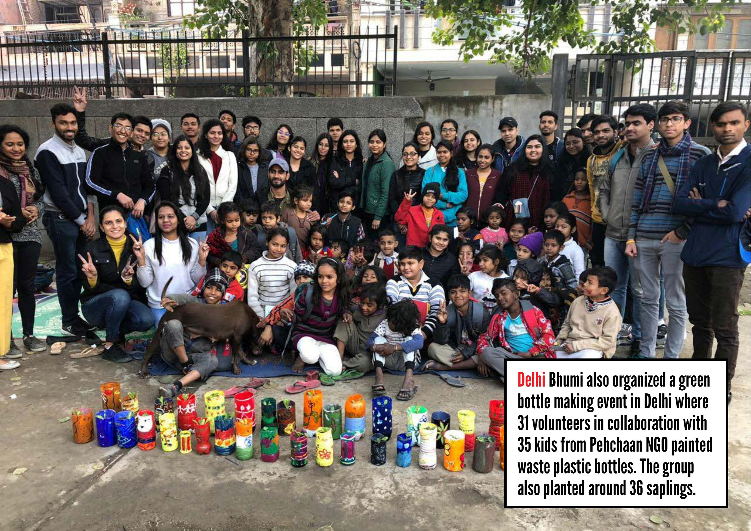
Delhi Bhumi also organized a green bottle making event in Delhi where 31 volunteers in collaboration with 35 kids from Pehchaan NGO painted waste plastic bottles. The group also planted around 36 saplings.