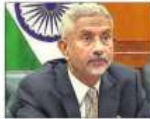
• S Jaishankar

China is the world's second largest economy and India is set to become the third largest, and