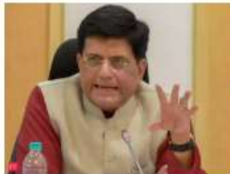
Piyush Goyal asked traders to fully contribute towards the Aatma Nirbhar Bharat campaign and called upon them to act as the whistleblowers.

New Delhi: Union Minister of Commerce and Industry Piyush Goyal on Sunday asked traders to undertake Customer Awareness campaign to make people buy make in India goods.