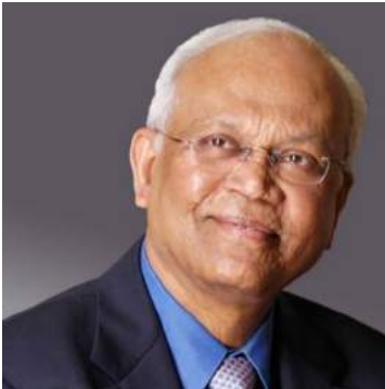
Dr RA Mashelkar Former Director General, Council of Scientific and Industrial Research

To find out what such an India could be, the Foundation has initiated a series of Fireside Chats called, I Have a Dream , with people synonymous with excellence in their field. These conversations reflect on the personal journeys of the speakers and also their wish list for India@100. They also provide important insights into what could be the way forward in areas key to the country's development.