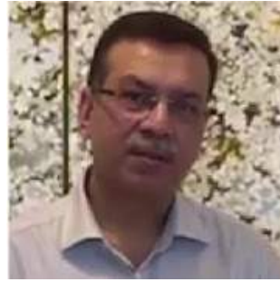
Dr Sanjiv Goenka