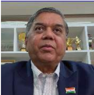
Late Tulsi Tanti