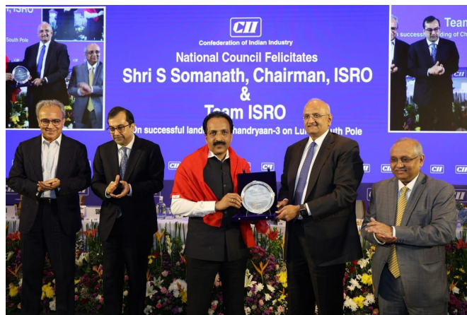
CII National Council warmly felicitates Shri S. Somanath, Chairman, ISRO (Indian Space Research Organization) and entire team of ISRO for the successful landing of Chandrayaan 3